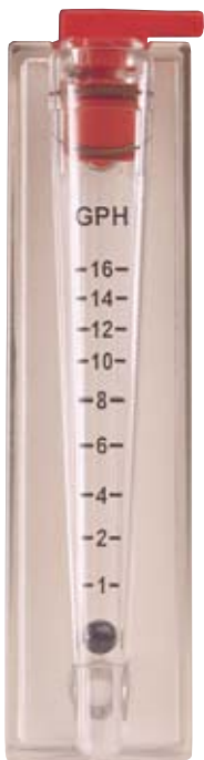
F-750 Series Adjustable