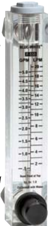
F-550A with Flow Adjustment Valve